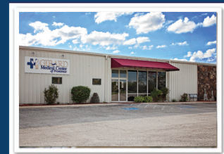
GMC of Frontenac 1011 N Hwy 69 620.235.1377